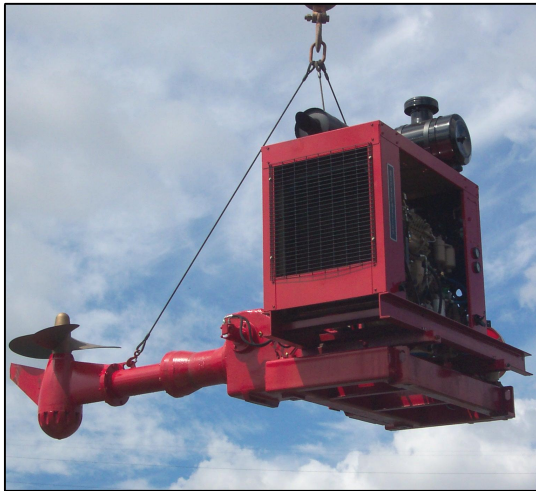
Picking a SW-3000 for installation