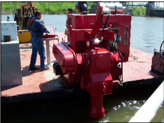
...and under way within one hour.